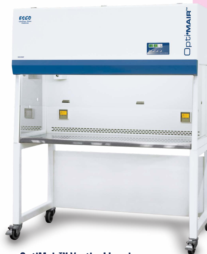
OptiMair™ Vertical Laminar Flow Clean Bench

● OptiMair Series Clean Benches are useful for mycology, food microbiology, plant and mammalian cell culture, clinical pharmacy and hospital protocols, cleanrooms, semiconductor assembly, pharmaceutical, aerospace and medical devices industries, where product protection is required for the user.