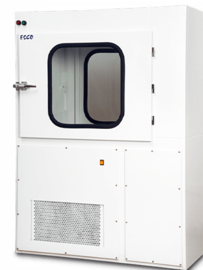
Infinity Air Shower Pass Box