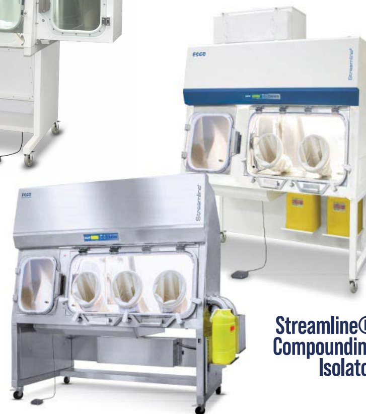
Streamline® Compounding Isolator