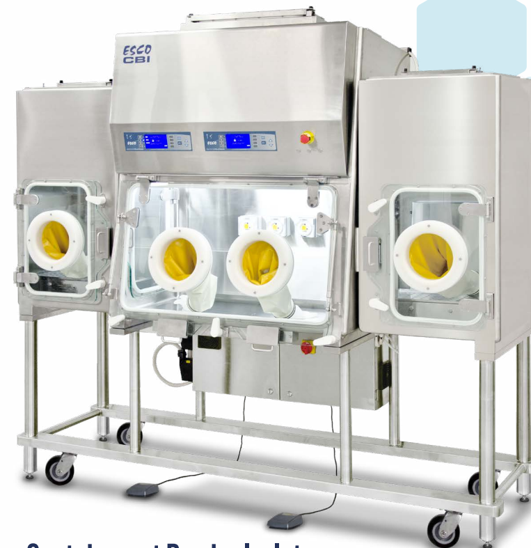
Containment Barrier Isolator

*Registered trademark of Dwyer Instruments, Inc.