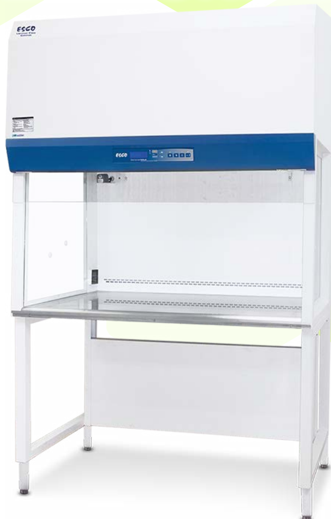
Airstream® Gen 3 Laminar Flow Clean Bench Glass Side Wall

the efficiency of its ULPA H14 filters. With more choice for customers, Esco laminar flow clean benches still offer the same level of product protection for your samples and processes where operator protection is not required.