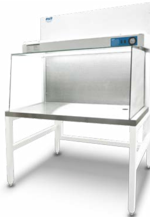
Airstream® Horizontal Laminar Flow Clean Bench For Plant Tissue Culture