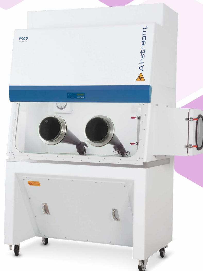
Airstream® Class III Biological Safety Cabinet

equipment, such as refrigerators, shelves, microscopes, centrifuges and incubators, can be installed inside the Class III cabinets upon request. Call 0330 113 0303 for more information on your cabinet options.