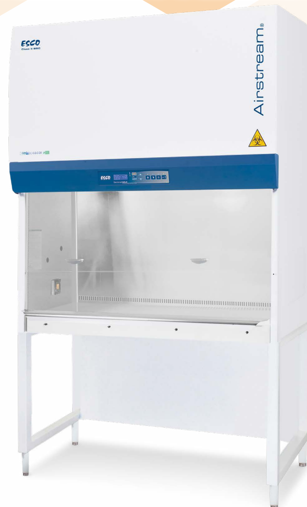
Airstream® Class II Biological Safety Cabinet Gen 3 S-Series

most energy-efficient Class II biosafety cabinet in the world, with 70% energy savings compared to AC motors. Self-compensating airflow, despite building voltage fluctuations and filter loading.