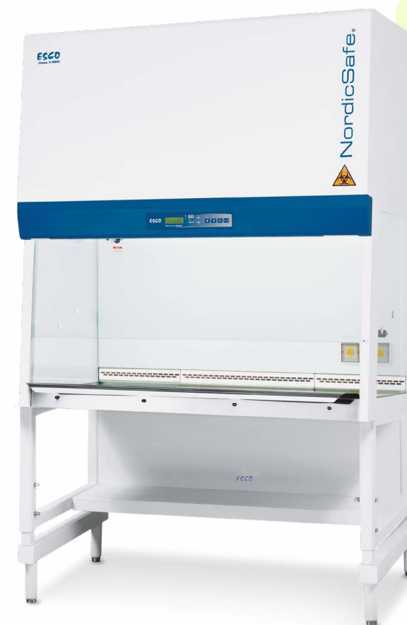
NordicSafe® Low Noise Class II Biological Safety Cabinet

● Available in 0.6m [2'], 0.9m [3'], 1.2m [4'], 1.5m [5'], 1.8m [6'] sizes