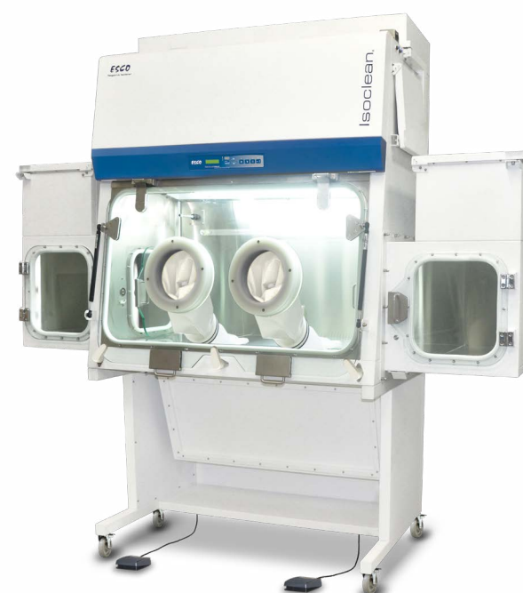
Isoclean® Healthcare Platform Isolator

Call 0330 113 0303 to speak with a Guardtech rep about all your equipment needs