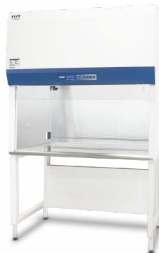
Airstream® Gen 3 Laminar Flow Clean Benches