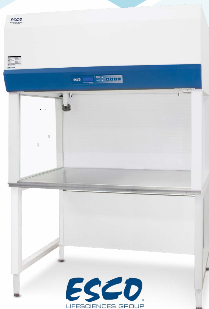
Airstream® Gen 3 Laminar Flow Clean Bench Glass Side Wall