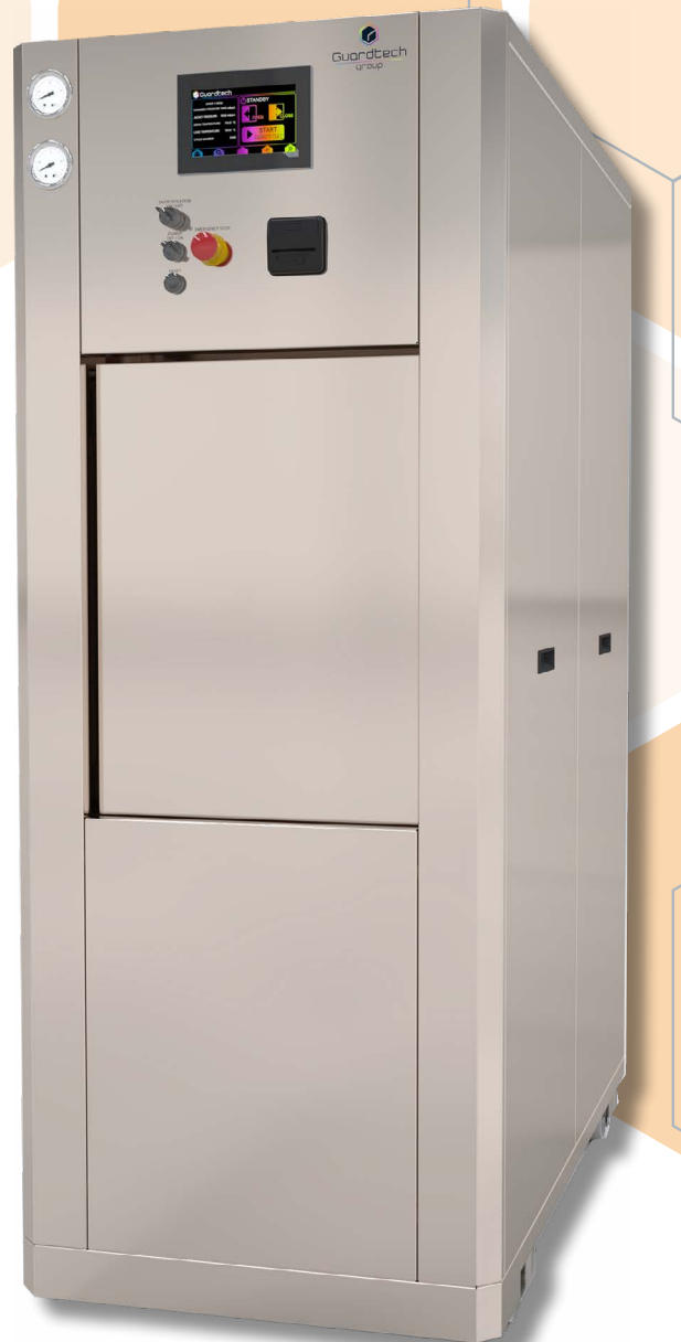
LAB300V free standing autoclave

● Other models in this range are the LAB150V and LAB225V which each share similar footprints and design characteristics