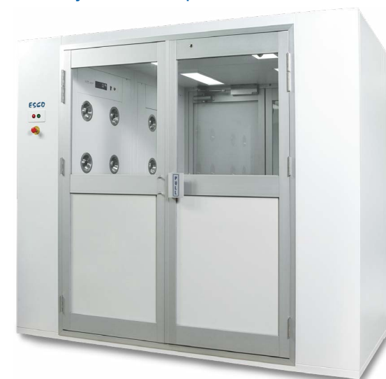
Multiple Occupancy Showers