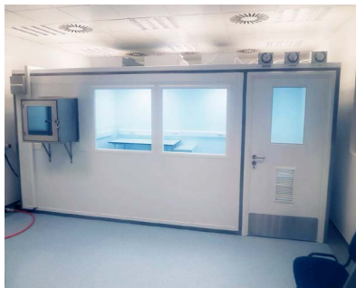
The Isopod situated at the client's premises in Budapest.