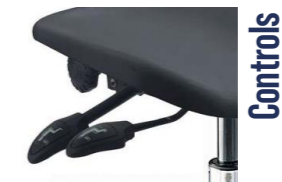
Task control with soft touch pneumatic adjusts seat height and backrest angle and height