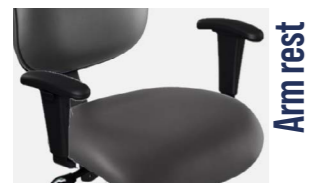
Optional arm rests – height can be adjusted & locked