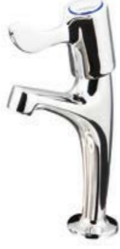
Lever 3" pillar tap