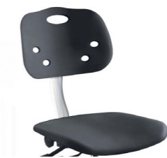
Seat and backrest made from Polypropylene containing UV inhibitor and antimicrobial properties