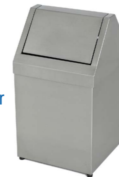
Flip lid bin