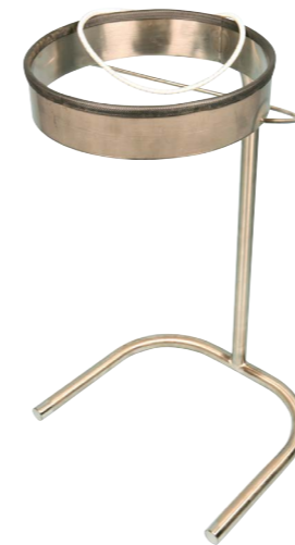
Waste bag holder