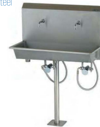
Pedestal version pictured