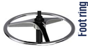
Optional height adjustable stainless steel footring – 22" diameter slides easily, holds positively and stays put