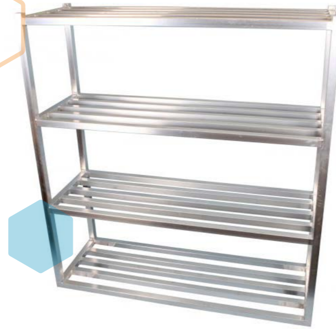
Four legs - four shelf units

For more info on these units, call 0330 113 0303