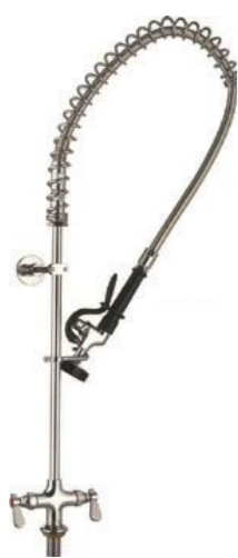
Pre-rinse mono block