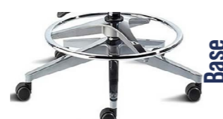
Resistance casters featuring a semi-soft tread that won't roll away easily