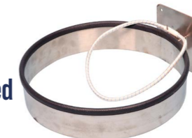
Wall-mounted bag holder