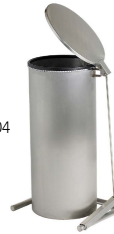
Shrouded pedal bin

● Waste sack holders in grade 304 stainless steel, open or shrouded units available with a hands-free system using a foot pedal to operate the lid, eliminating hand contact and minimising the risk of contamination.