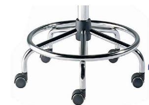
Built-in tubular footring. Resistance casters featuring a semi-soft tread that won't roll away easily