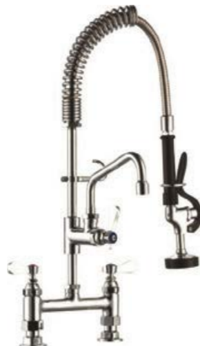
Short pre-rinse with pot filler