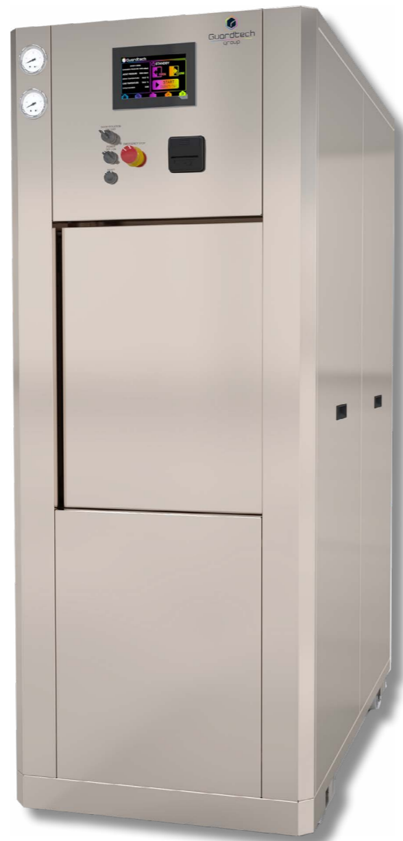
LAB300V free standing autoclave

● Other models in this range are the LAB150V and LAB225V which each share similar footprints and design characteristics