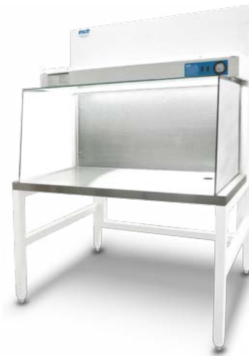
Airstream® Horizontal Laminar Flow Clean Bench (For Plant Tissue Culture)