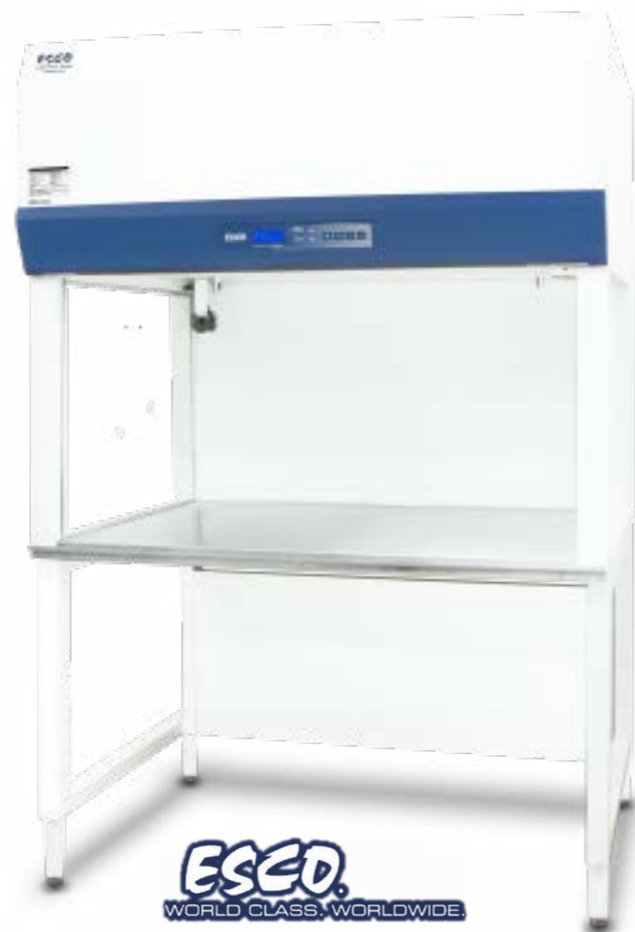
Airstream® Gen 3 Laminar Flow Clean Bench (Horizontal - Glass Side Wall)