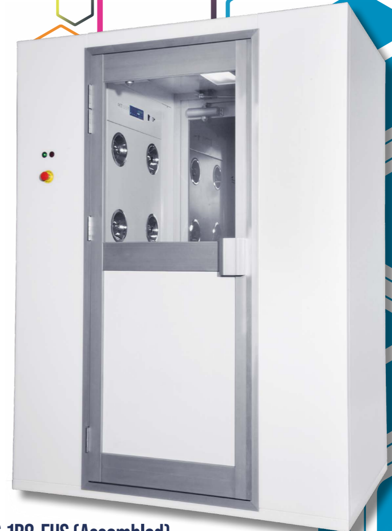
EAS-1B8-EUS (Assembled) Cleanroom Air Shower

● Mini-pleated HEPA filtration achieves > 99.999% typical efficiency at 0.3 micron particles