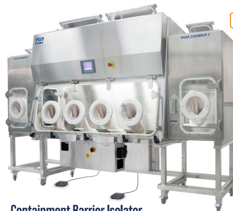
Containment Barrier Isolator

*Registered trademark of Dwyer Instruments, Inc.