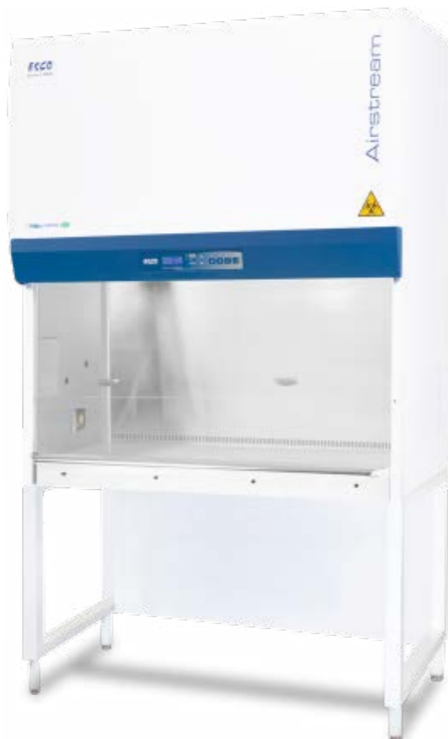
Airstream® Class II Biological Safety Cabinet Gen 3 S-Series

most energy-efficient Class II biosafety cabinet in the world, with 70% energy savings compared to AC motors. Self-compensating airflow, despite building voltage fluctuations and filter loading.