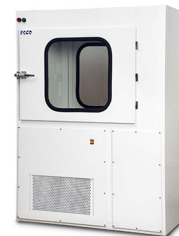
Infinity Air Shower Pass Box