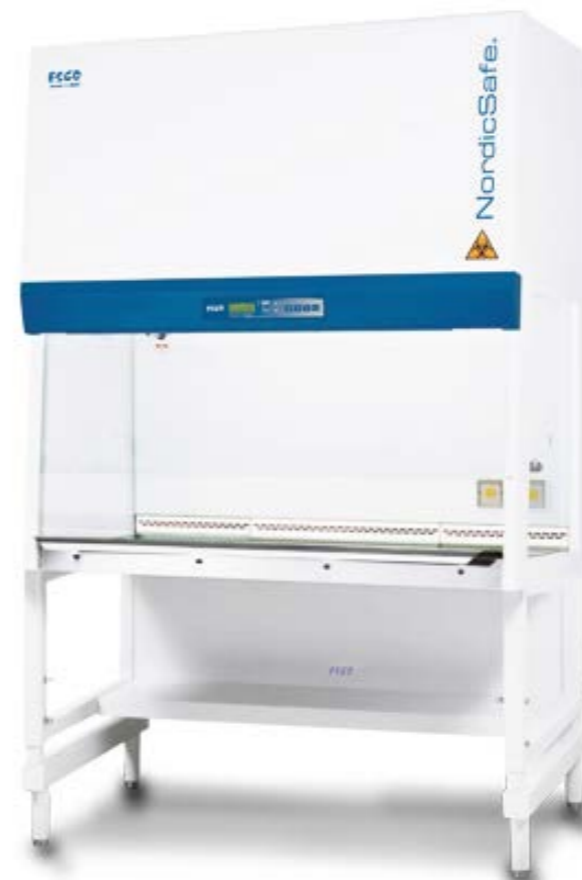
NordicSafe® Low Noise Class II Biological Safety Cabinet