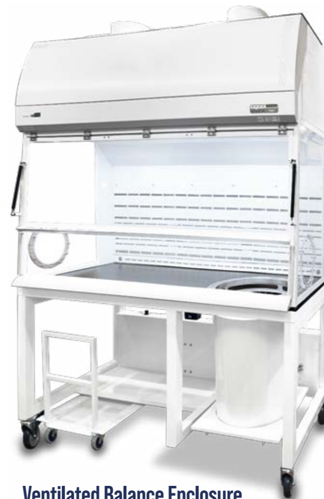
Ventilated Balance Enclosure